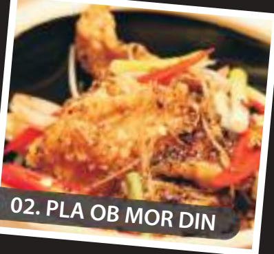
02. PLA OB MOR DIN