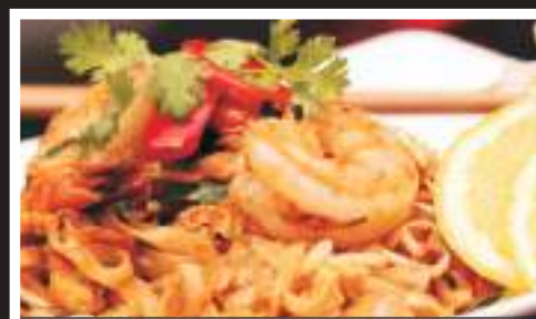
19. PAD THAI SEAFOOD