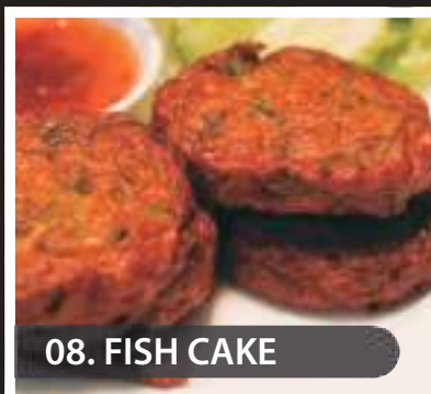
08. FISH CAKE