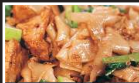
18. PAD SEE EW TOFU