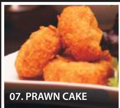
07. PRAWN CAKE