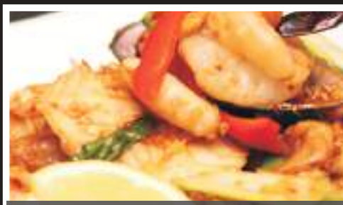
13. GARLIC & PEPPER SEAFOOD