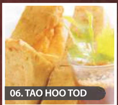
06. TAO HOO TOD