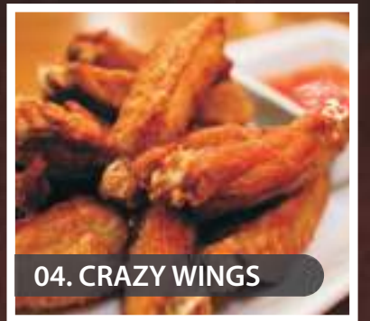
04. CRAZY WINGS