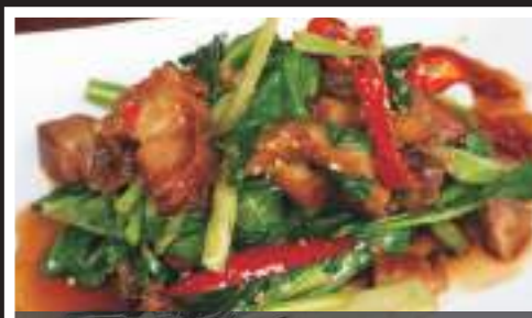
17. KA NA MOO KROB