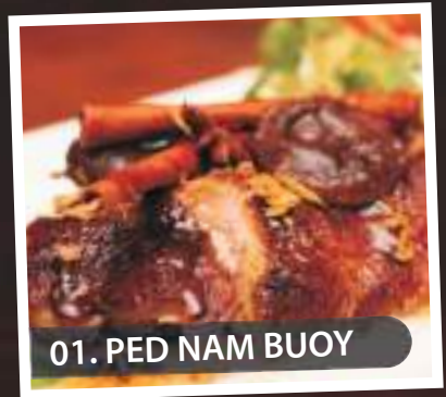
01. PED NAM BUOY