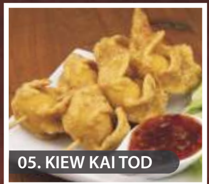
05. KIEW KAI TOD