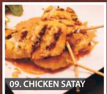
09. CHICKEN SATAY